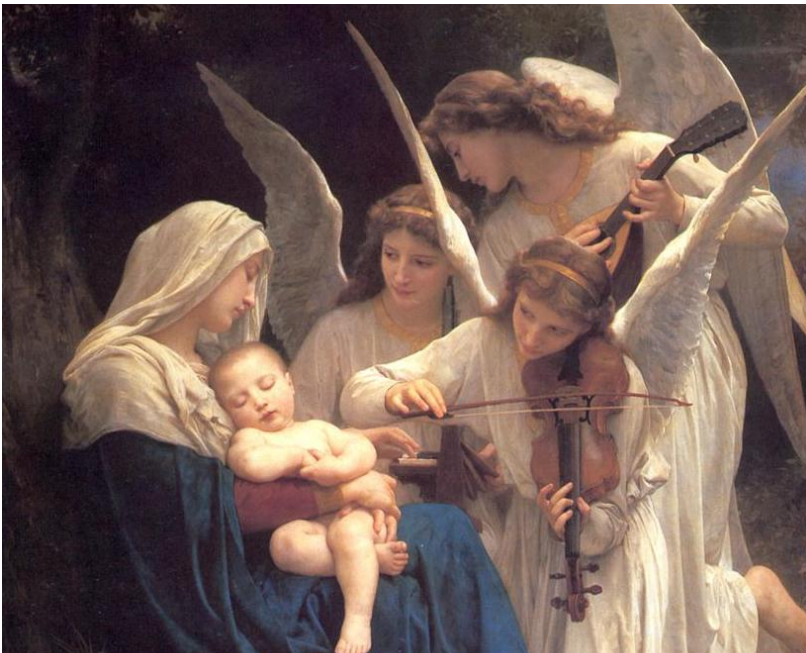
Art Credit: Song of the Angels , William-Adolphe Bouguereau, 1881